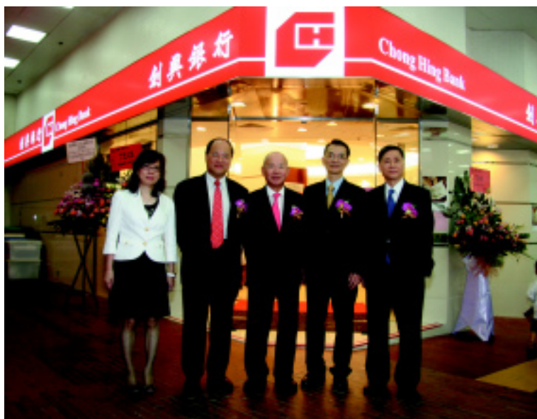
Leung King Estate Branch in Tuen Mun commenced business on 30 June 2008. Together with Hau Tak Estate Branch and Choi Ming Court Branch in Tseung Kwan O, three new branches were opened in 2008.

The Bank embarked on a whole new corporate image promotion campaign in 2008, focusing on its niche as a “community bank” and dedication to providing comprehensive and quality banking services to the local community.