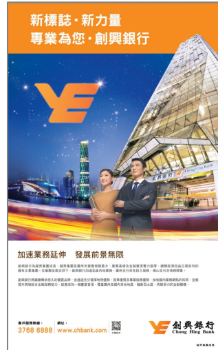
The brand new corporate advertisement on “New Logo · New Power”.

In celebration of the launch of the new logo, Chong Hing Bank has rolled out the “Welcome Delight” banking products promotion, bringing a series of offers* to new customers, including: