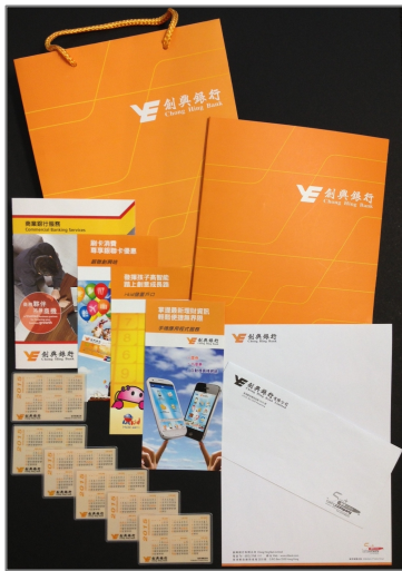
Various promotional materials and corporate items of Chong Hing Bank with the new logo.